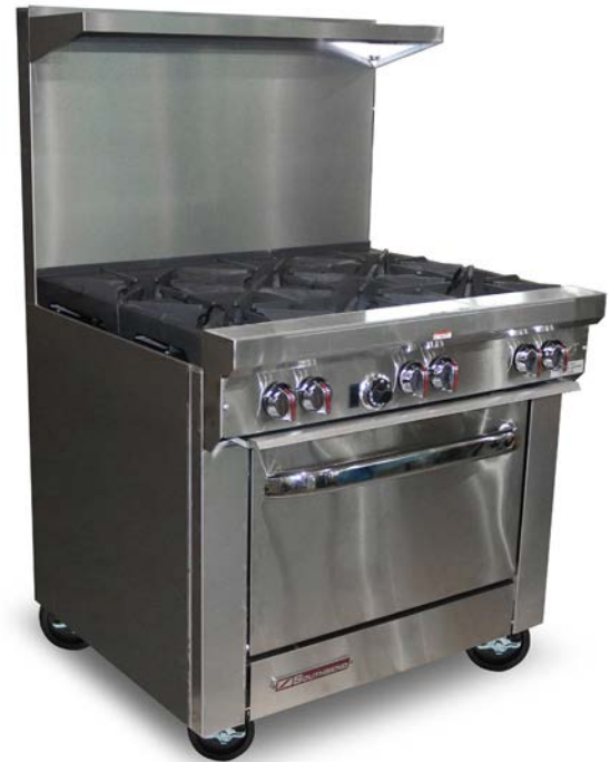
(S36D shown with optional casters)

S36D - 6 Open Burners, Standard Oven S36A - 6 Open Burners, Convection Oven S36C - 6 Open Burners, Cabinet Base