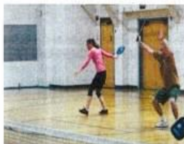
Wow! Middle of the Night Pickleball!