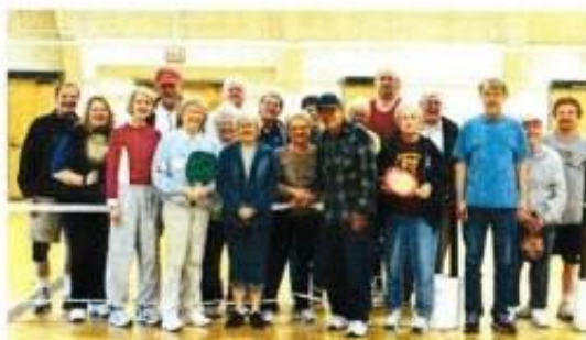
24 hours of pickleball fun for all!