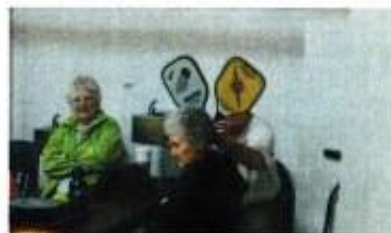
With friends like this...