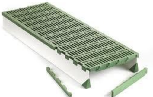
Fibreglass Support Beam & End Strips

The edge strips provide a clean finish, ensuring a proper closing of expansion gaps and smooth connection to concrete surfaces.