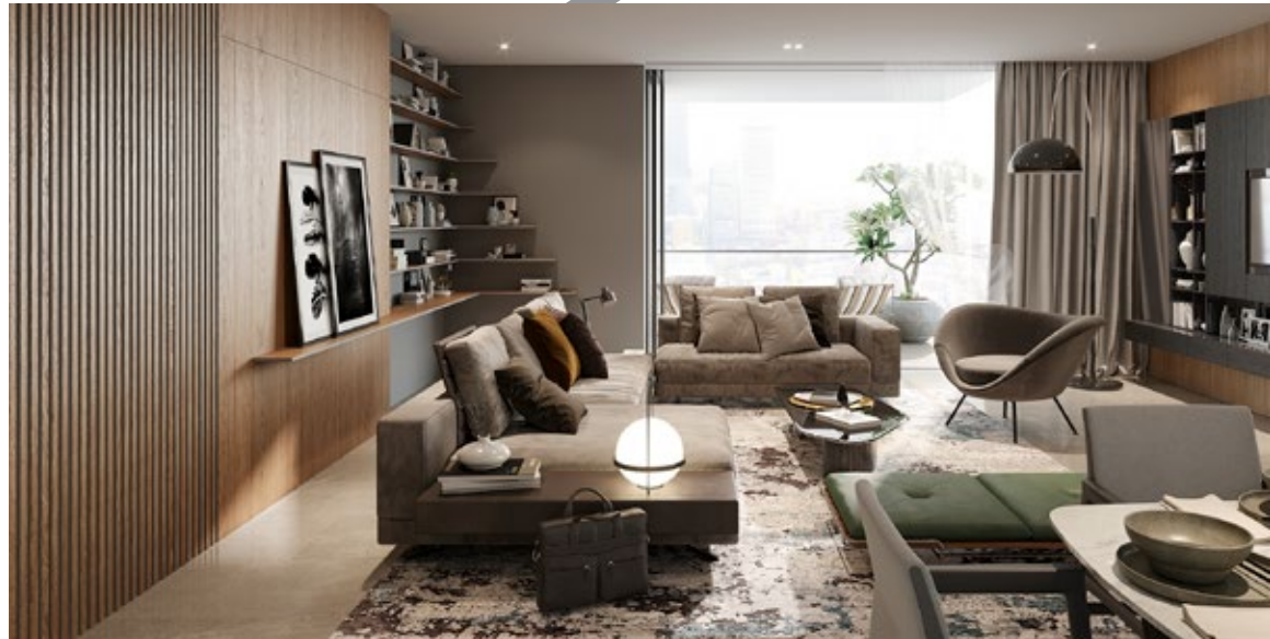
TOP: SPACIOUS LIVING AREA WITH VIEWS OF THE MEKONG IS SURE TO IMPRESS BOTTOM: VIEW OF THE BATHROOM WITH BATHTUB & DUAL SINKS