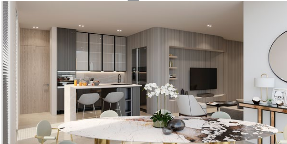
TOP: SPACIOUS DINING & LIVING AREA WITH OPEN DRY KITCHEN BOTTOM: VIEW INTO THE MASTER BEDROOM OVER THE EN SUITE BALCONY