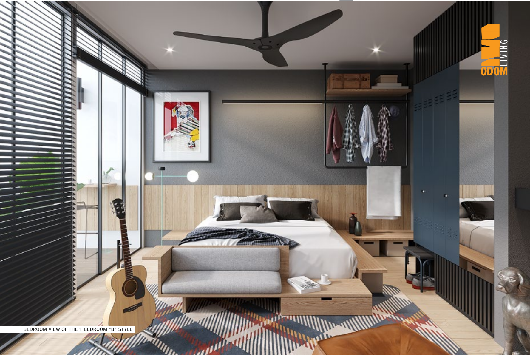
BEDROOM VIEW OF THE 1 BEDROOM "B" STYLE