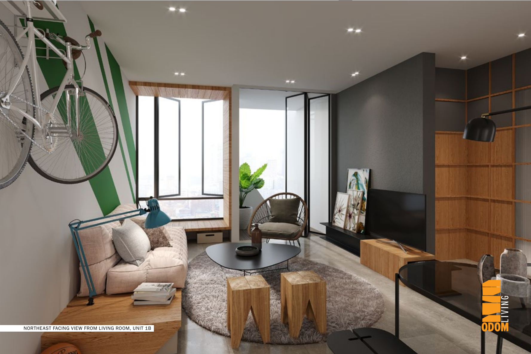
NORTHEAST FACING VIEW FROM LIVING ROOM, UNIT 1B