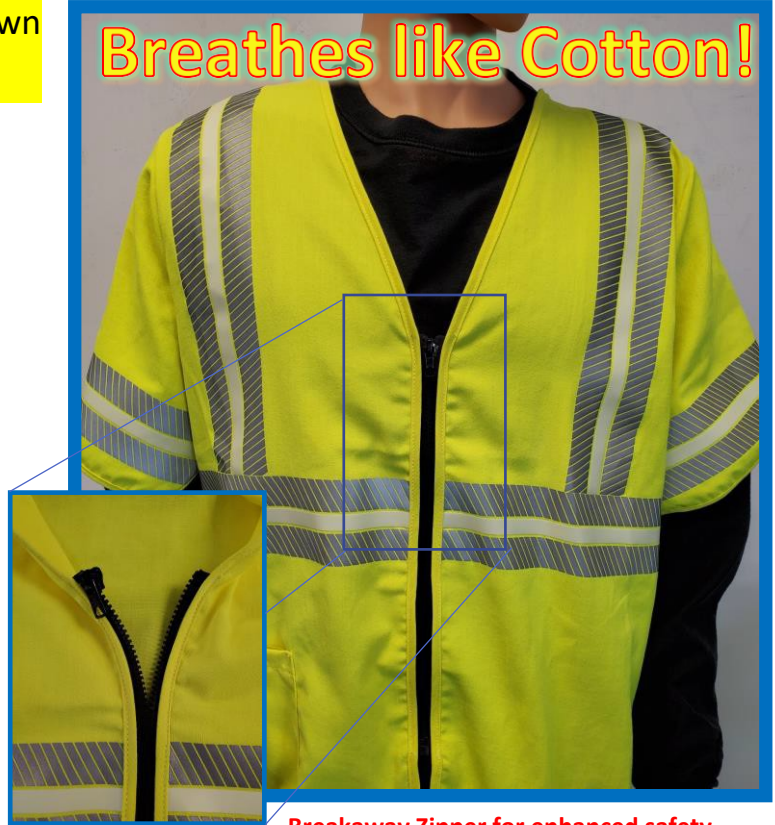
Breakaway Zipper for enhanced safety