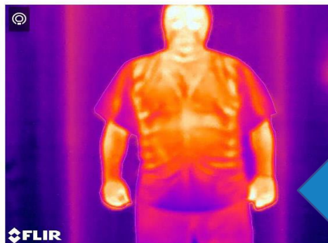
Subject spent following hour in controlled temperature room

Mesh material holds heat because it does not breathe,