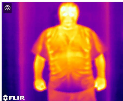
Subject spent 1 hour in 140 degree sauna with Modacrylic mesh vest