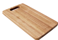
CB 932 Chopping Board