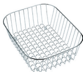
DB 448 Drainer Basket