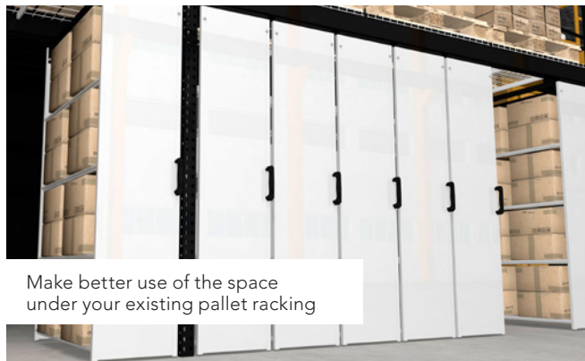
Make better use of the space under your existing pallet racking