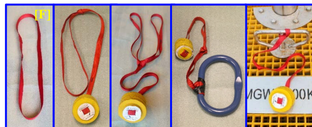
Attachment using the standard extension strap [F] tied to a loop integrated in the fist strap.

* Lengths are inclusive of the 0.5m long standard extension strap [F]. Other lengths on request.