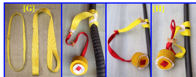
Attachment to cables, hoses, jumpers or other, using the webbing loop 20mm or 50mm wide [G], with or without, temporary strap shortening ring [H].