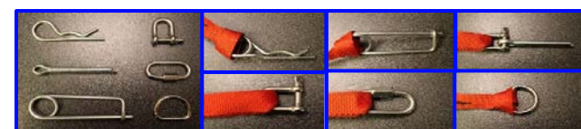
Attachment with 'attachment accessories' (with or w/o standard extension strap).

If delivered loose, relevant User Guide / Procedure for configuration, adjustment and attachment of fists will be provided.