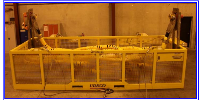
Ubas H with two single MQC / Cobra Head Parking Stands and a 165m long 17cm dia. HFL with double spiral guard.