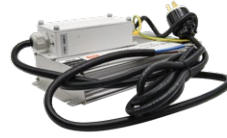
Power adapter with regional plugs