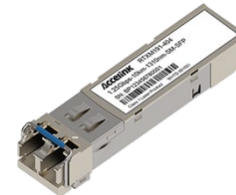
SFP optical module