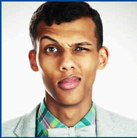
Papaouta by Stromae