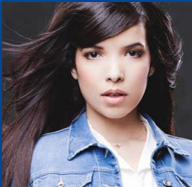
Dernière Danse by Indila