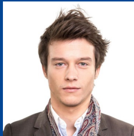
Si on ne vit qu'une fois by Sidoine