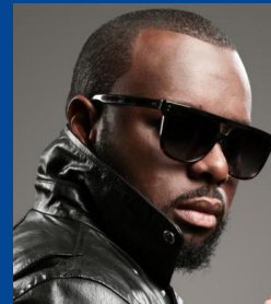
Reste by Maitre Gims

Mon vote! Je préfère _____ car j'adore la musique!