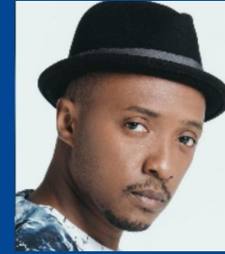
Millionaire by Soprano