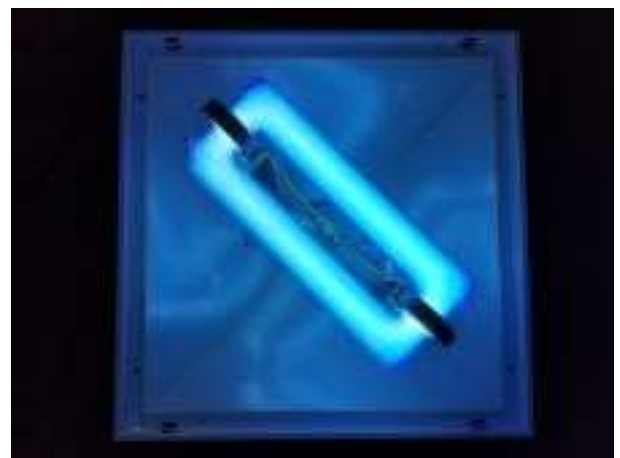
Live photo of an active 250-watt lamp

Exposed bulb provides UV and Ozone sterilization with air circulation by the areas own HVAC system.