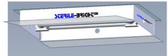
Open Doors lamp retracted