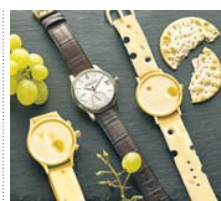
WIND AND CHEESE What determines if a watch qualifies as Swiss-made? A pungent primer D5