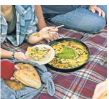
PICNIC OF THE BUNCH Tips on al fresco eating from the hungry mind behind Patagonia Provisions D7