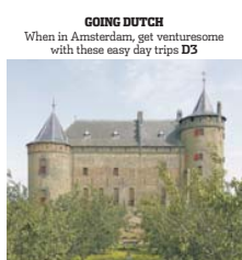
GOING DUTCH When in Amsterdam, get venturesome with these easy day trips D3