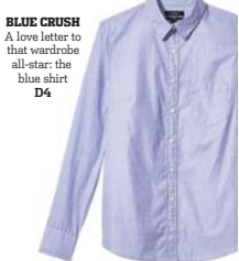
BLUE CRUSH A love letter to that wardrobe all-star: the blue shirt D4