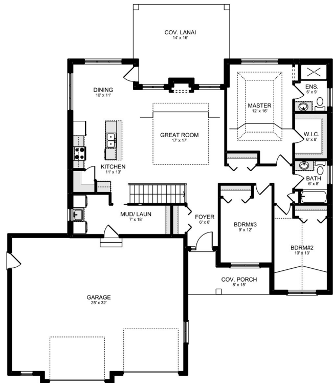
MAIN FLOOR PLAN AREA = 1710 Sq.ft.