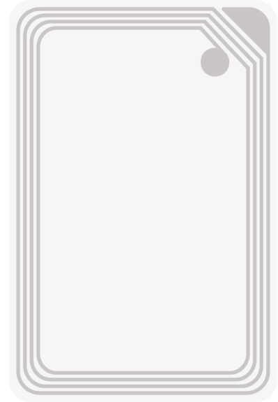
Tag shown at actual size