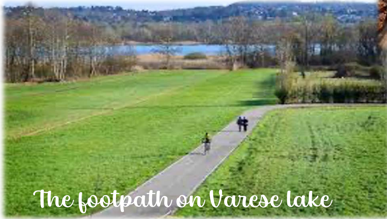
The footpath on Varese lake