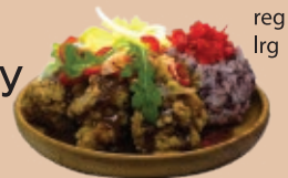
Japan Curry Bell peppers & onion.