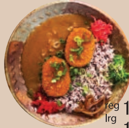
Japan Curry Croquette (vegetarian)