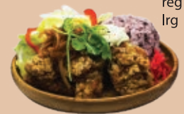
Nanban Garlic aioli, onion, citrus-soy.