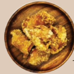
6 PCS Gushi Chicken with Original Sauce (chicken only)