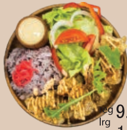
Original Gushi Chicken