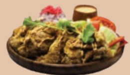
Original Sesame sauce & spicy mayo.