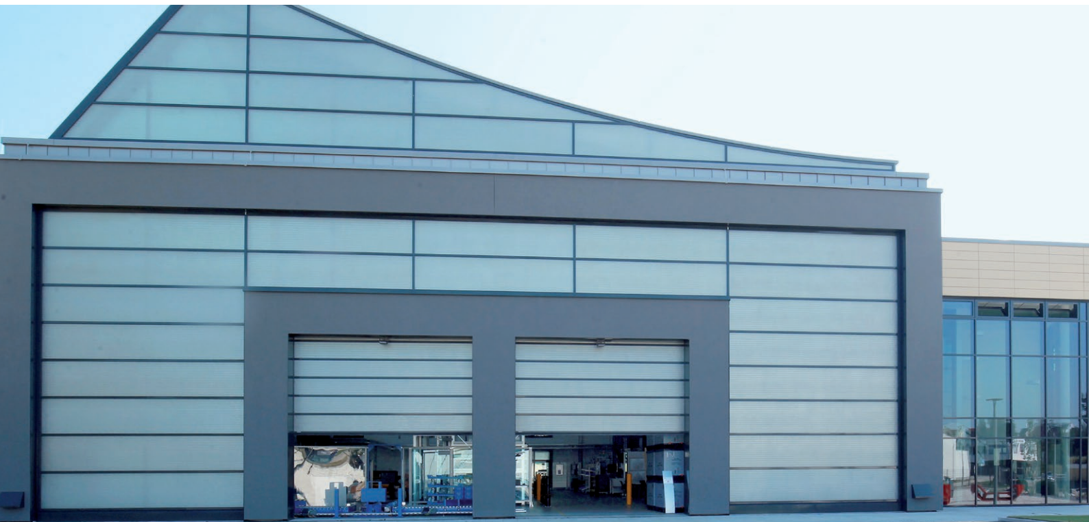
Door and facade of translucent fibreglass create impressive design and ergonomic aspects.

Take advantage of our expertise in planning and consulting. It is the result of decades of experience and thousands of successful projects.