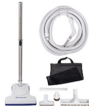
Gold Cleaning Kit