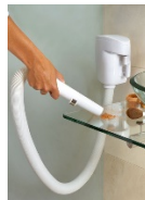
Miniature Vacuum on a Wall