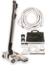
Platinum Cleaning Kit