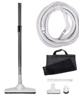
Silver Cleaning Kit