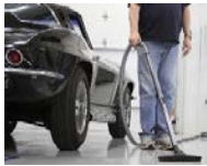
Inlet in Garage