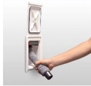
Hose stored in the Wall