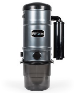
Silver Power Unit