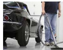
Inlet in Garage