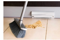
Automatic Dustpan in Kitchen