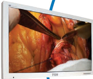
Flat Screen Displays