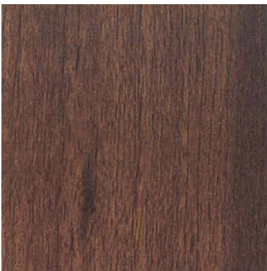
Super Light National Walnut

Our team of experts and readily available resources allow us to go above and beyond when we collaborate on a project. Our most popular feature at the moment is the wood grain powder coat finish. This finish gives an alternative to traditional wood, which requires regular maintenance and will eventually rot or split. From over 1,000 powder coat finishes to choose from, there is an option for every project. No matter the size or complexity, our team can bring your vision to life.