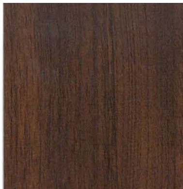
Super Dark National Walnut