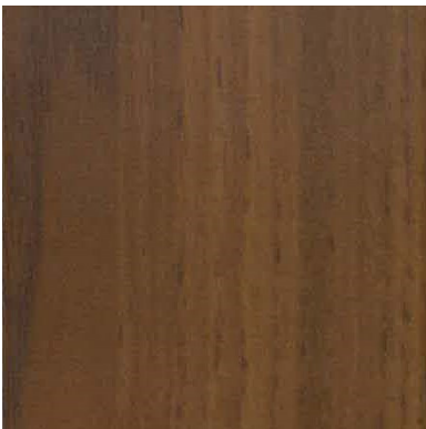
Super American Oak