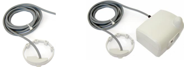
With ARROW remote reading system