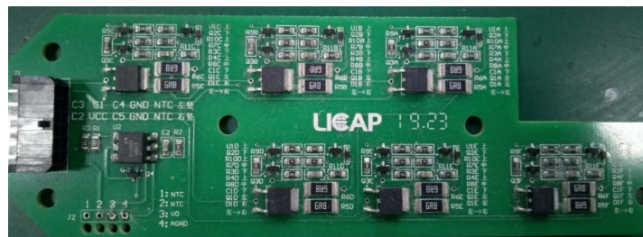
Figure 2 - PCBA for 16V/500F Module

With this active balancing circuit, cells maintain a voltage balance amongst themselves to ensure similar cell to cell performance towards achieving a long module lifespan. The active balancing circuit is currently implemented in LICAP modules such as the 16V/500F and 48V/165F.