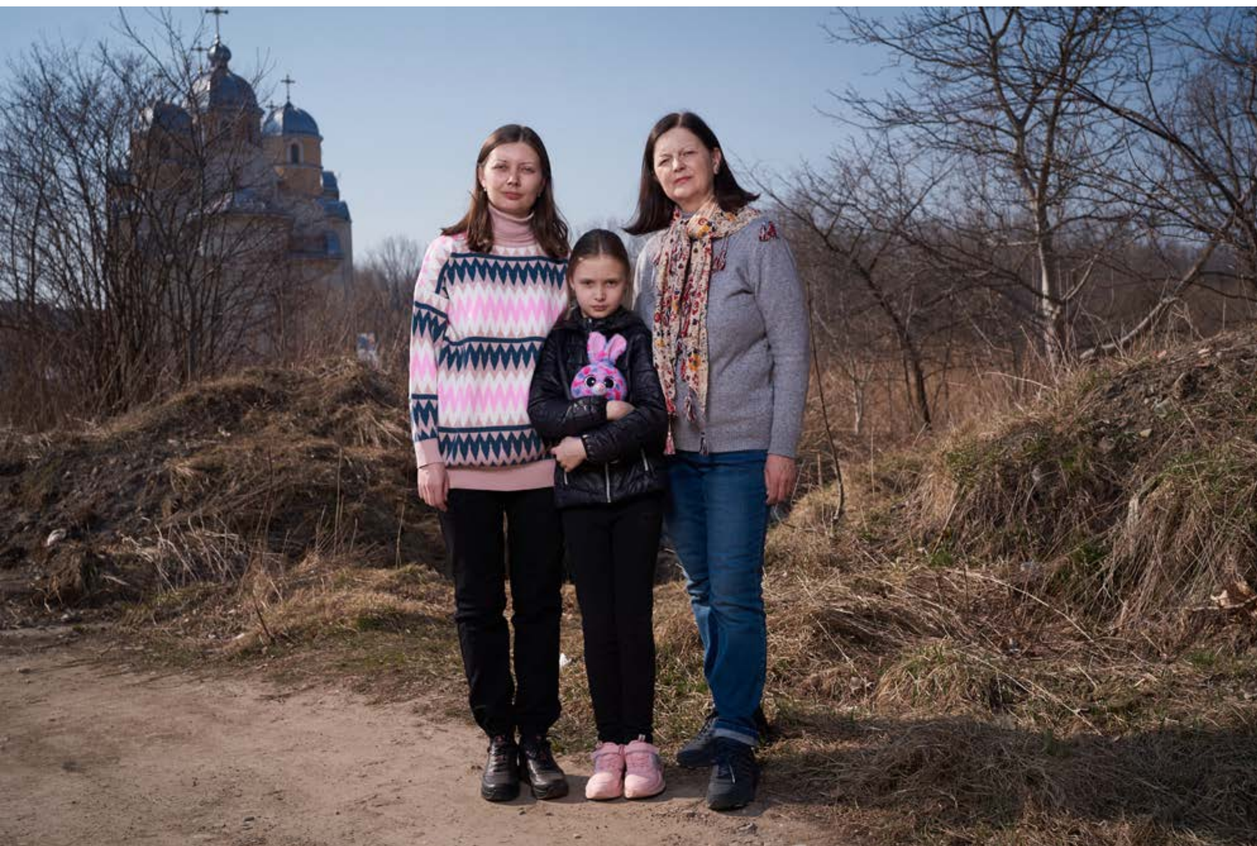
© Serhii Korovayny | Refugees Twice