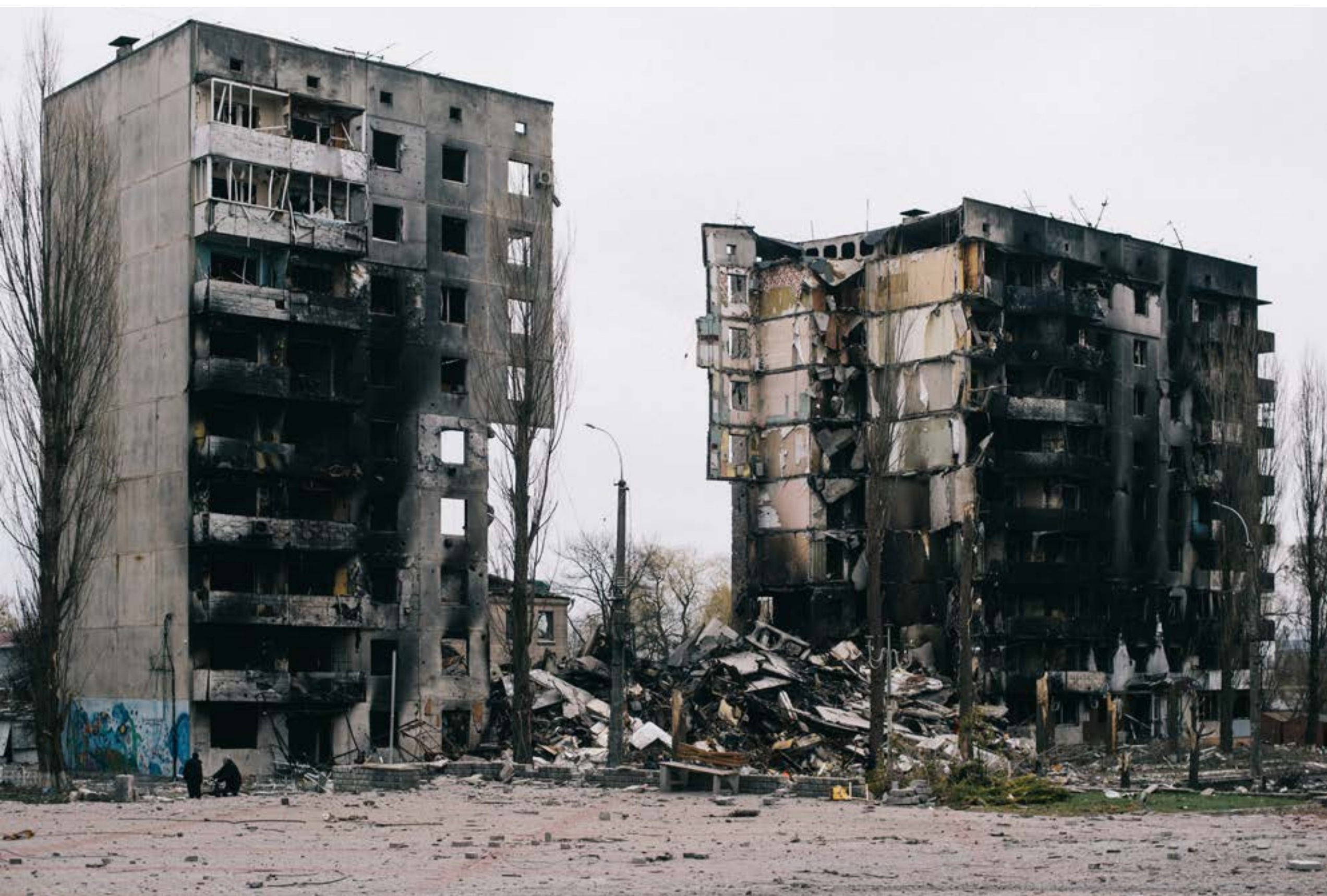
© Maxim Dondyuk | Ukraine, 2022