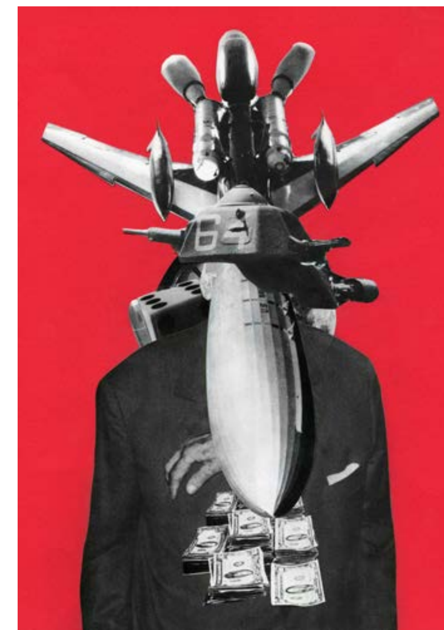
42 Kon Markogiannis Inhumanoid Inspiration Feature