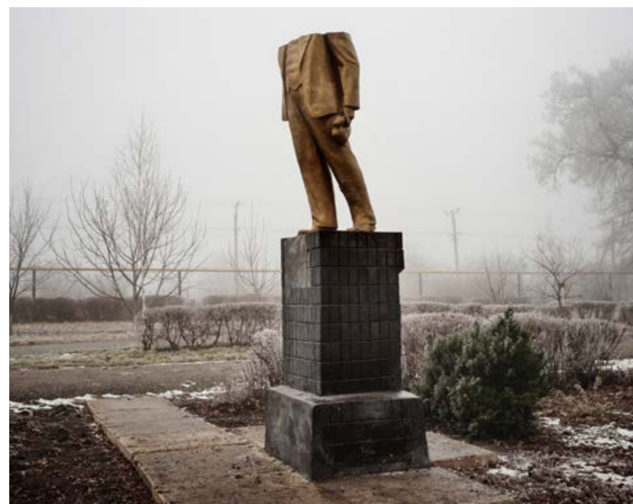
Guillaume Herbaut Winner World Press Photo Photo Culture