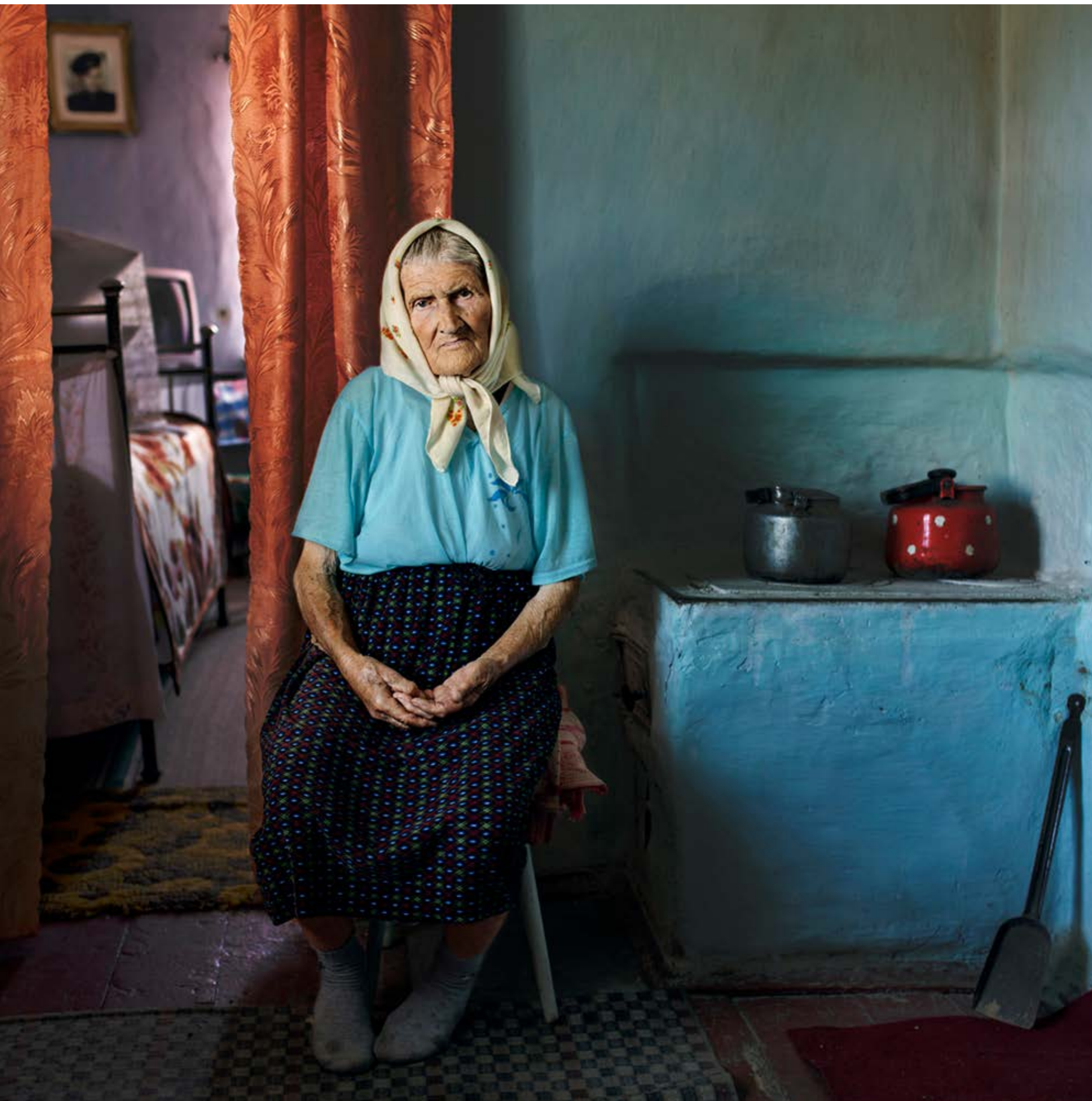
Lands of No-Return