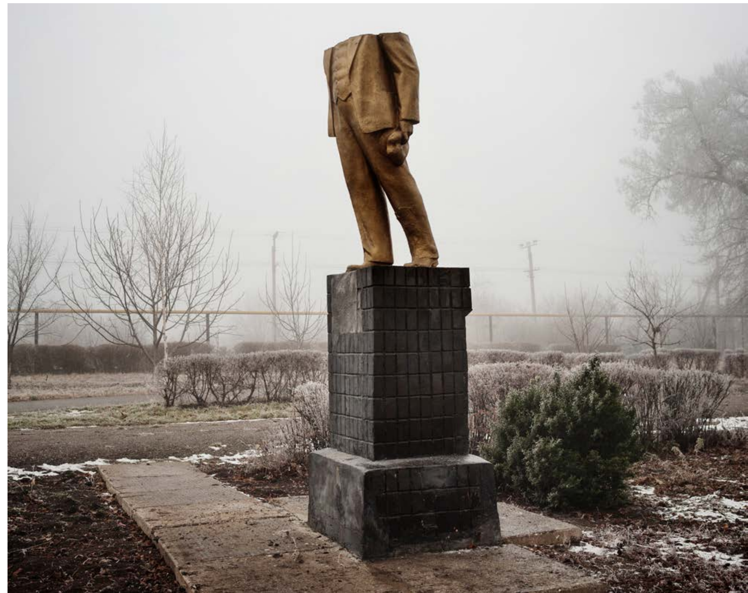
A decapitated statue of Lenin stands in Cheminots Park, Kotovsk, Ukraine, on 19 December 2013. The statue was destroyed by ultra-nationalists on the night of 8–9 December.

The Jury of the World Press Photo comment