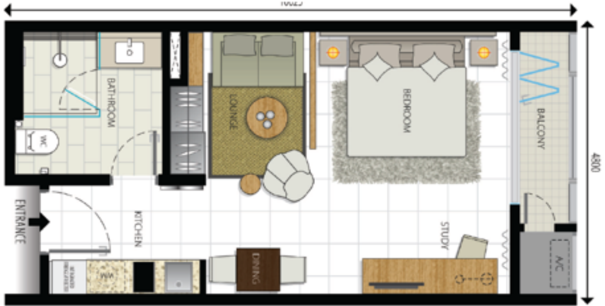
TYPE F 1 STUDIO ROOM : 510SQFT