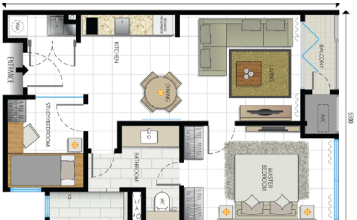
TYPE G 1 STUDIO ROOM : 510SQFT