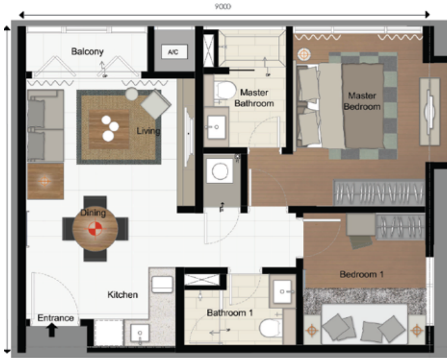
TYPE D 22 BEDROOM 2 BATHROOM : 698SQFT