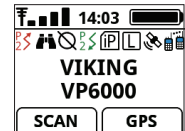
Day - High Contrast