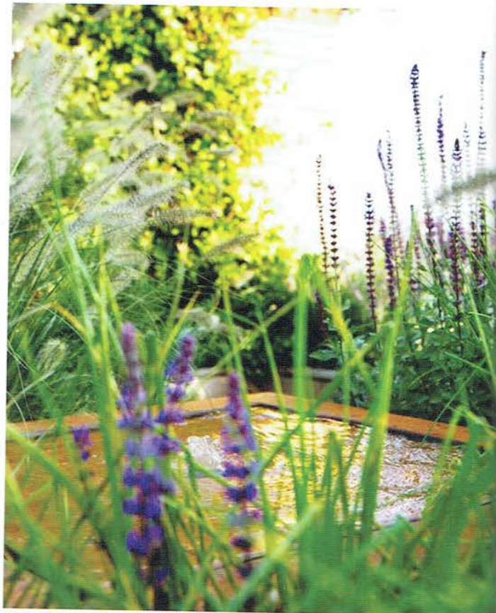
1.2m Square Corten Steel Water Table

As co-curator of Cityscapes alongside Darryl Moore the two have worked closely with the RHS Urban Garden Show. In 2016 and 2017 Adolfo & Darryl visited our warehouse to look for stand out products to create an installation at the show. We provided Corten Steel and Aluminium planters and features that were coupled with lush tropical plants from Arnott & Mason creating a natural yet industrial looking area within the show.