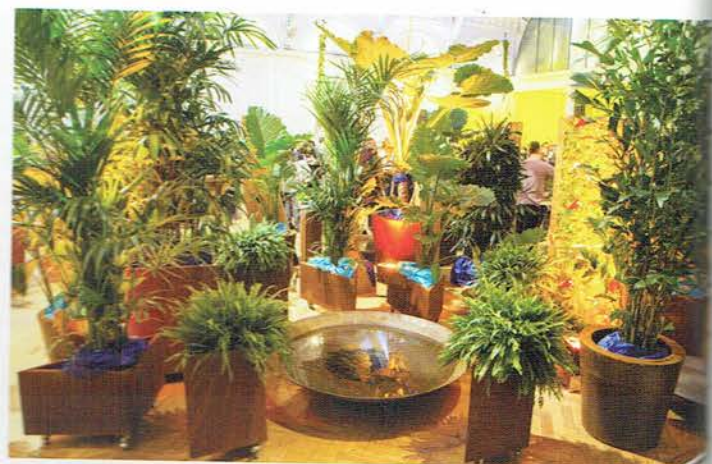
RHS Urban Garden Show 2016 Corten Steel Water Bowls and Bespoke Planters