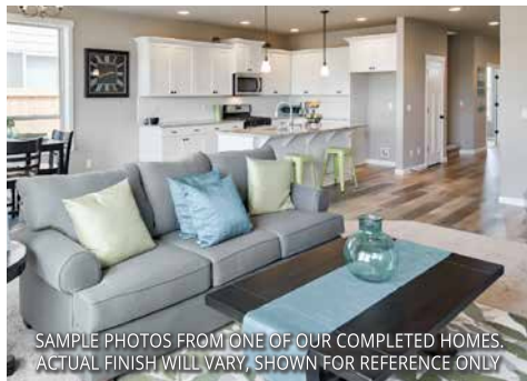
SAMPLE PHOTOS FROM ONE OF OUR COMPLETED HOMES. ACTUAL FINISH WILL VARY, SHOWN FOR REFERENCE ONLY