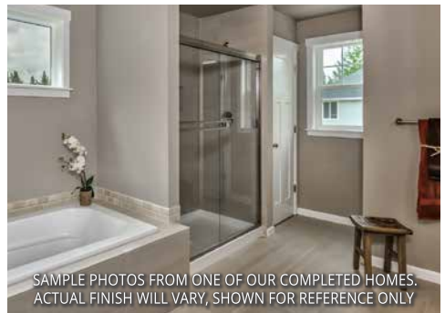
SAMPLE PHOTOS FROM ONE OF OUR COMPLETED HOMES. ACTUAL FINISH WILL VARY, SHOWN FOR REFERENCE ONLY

Welcome to your dream home. Healthy, energy efficient Stafford homes are designed with the buyer in mind. This home has fine craftsmanship details, is built-above-code industry construction standards, and full of energy-efficient appliances to save the residents money monthly with lower than average utilities cost . All Stafford homes are move-in ready , as well as safe for the family by using certified building materials for industry health standards. Come see one for yourself and fall in love with your new-home today!