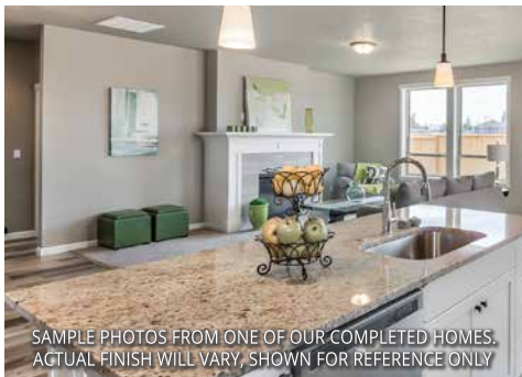
SAMPLE PHOTOS FROM ONE OF OUR COMPLETED HOMES. ACTUAL FINISH WILL VARY, SHOWN FOR REFERENCE ONLY

3 Bed | 2.5 Bath | 1574 SF | 3 Car Garage | Craftsman LOT 37 | 6052 Eagle Dance St Salem 97306 | $354,900