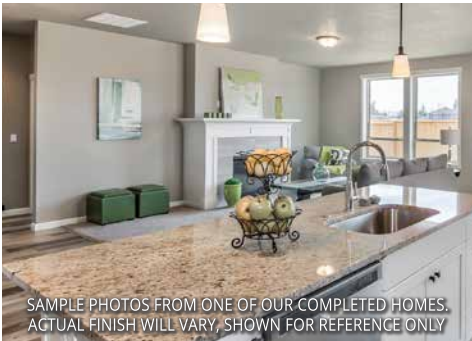
SAMPLE PHOTOS FROM ONE OF OUR COMPLETED HOMES. ACTUAL FINISH WILL VARY, SHOWN FOR REFERENCE ONLY

3 Bed | 2 Bath | 1722 SF | 3 Car Garage | Craftsman LOT 8 | 1708 N River Alder St Canby 97013 | MLS19004276 | $434,900