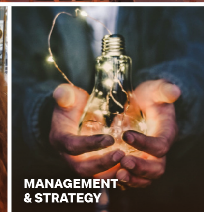
MANAGEMENT & STRATEGY