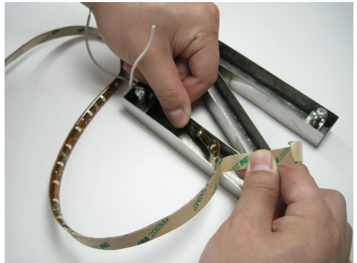
4. Peel 3M tape and stick on the channel letter.