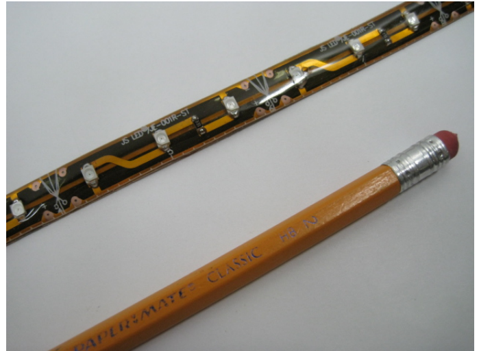
2. 3/8" wide