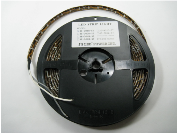
1. Packing in 200 inches/ roll.