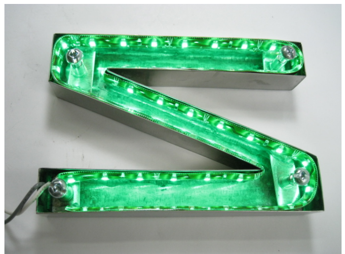
6. Light up Halo performance