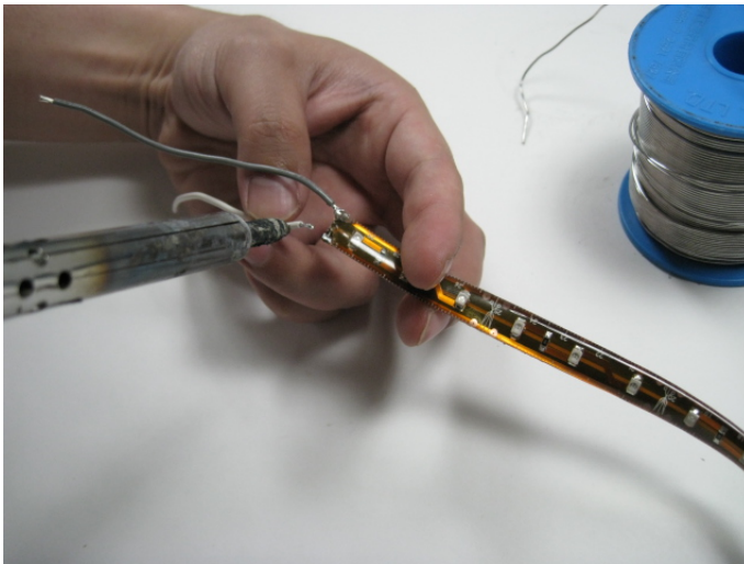
3. Soldering 18 gauge connection wire.