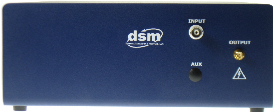
Figure 1. Front Panel View

The VF-500 applies a gain of 20 to an analog input signals and generates an output voltage suitable for driving or actuating piezoelectric materials of the types described previously.