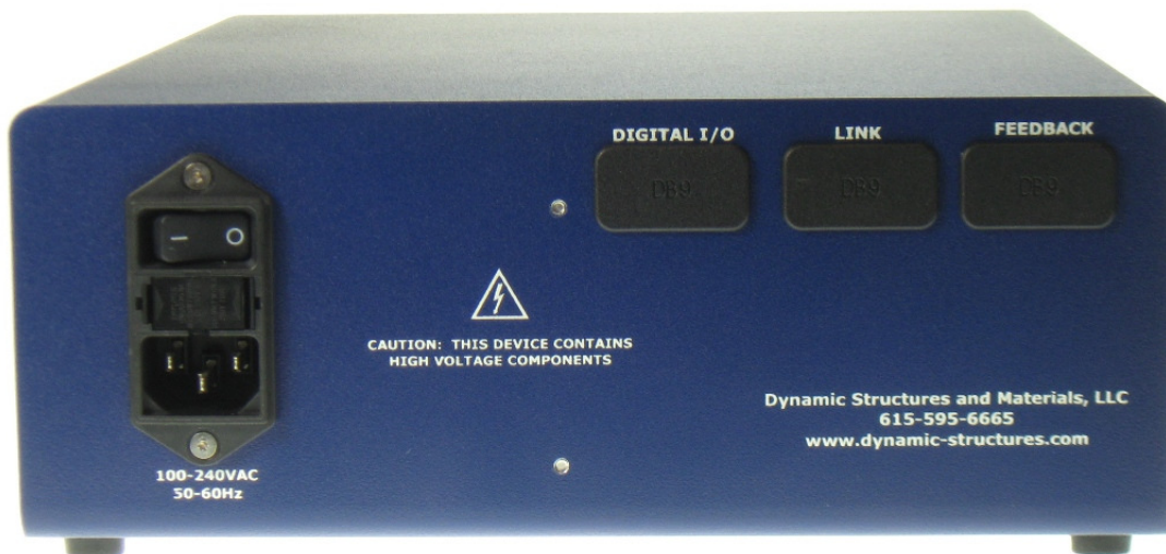
Figure 2. Rear View