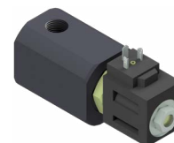
Electric shut off valve