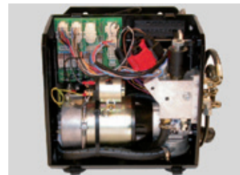
LOW NOISE POWER UNIT & NO ELECTRONICS = EASY MAINTENANCE