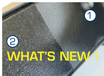
POWDER COATING PAINT (2) ADDED TO KTL PLUS (1). NO RUST AND NO SALT STAINS.