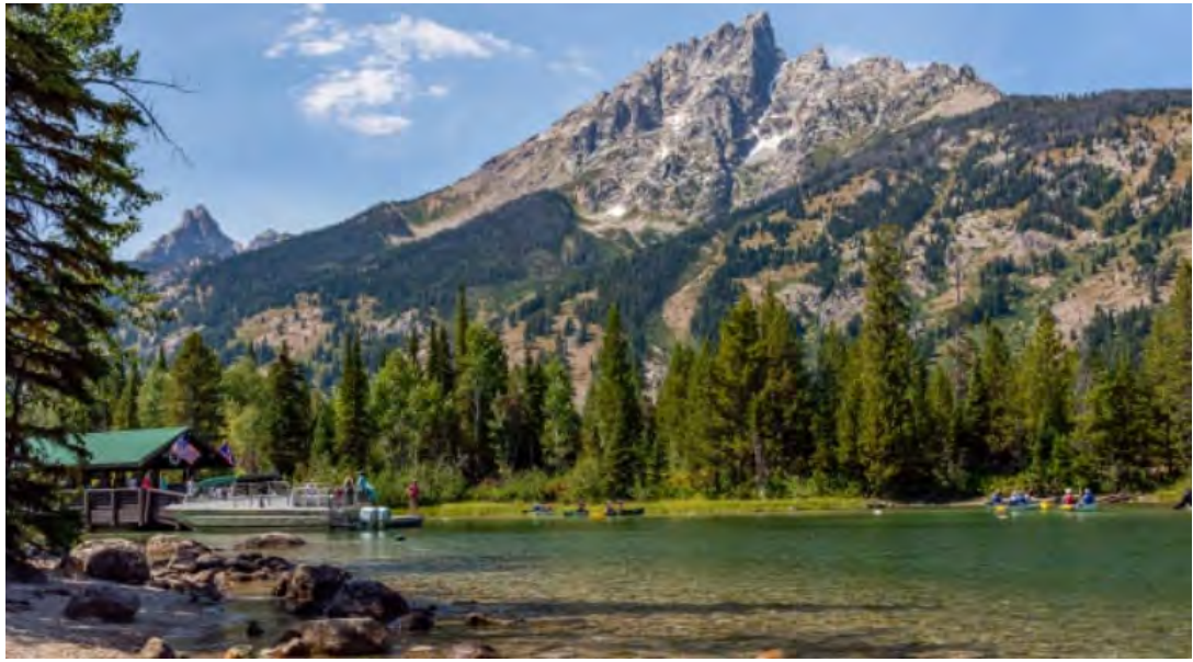
Jenny Lake at Grand Teton National Park, Wyoming, is filled with glacier water.