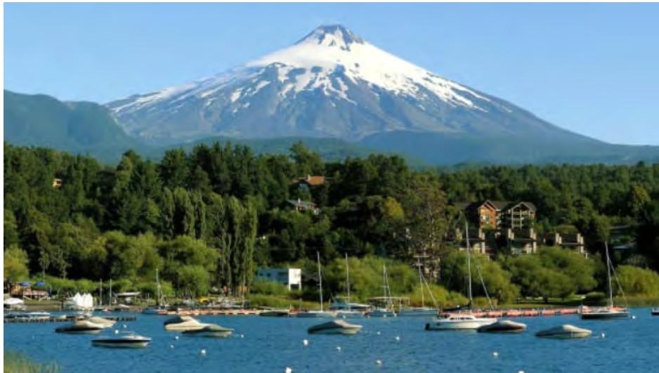
"Los Lagos" offers travelers stunning landscapes, serenity and on December 14, a total solar eclipse over the town of Pucón at 1:03 p.m. local time.