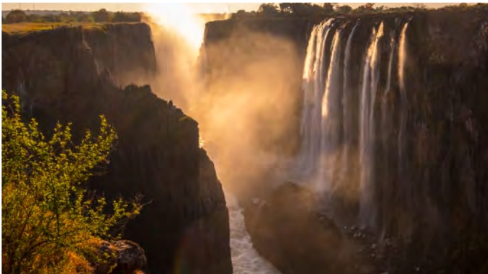
Victoria Falls offers thundering cascades, white water rafting, zip line facilities and bungee jumping.