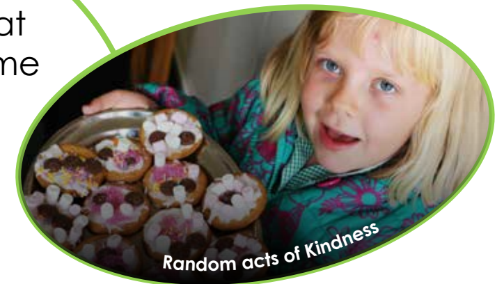
Random acts of Kindness