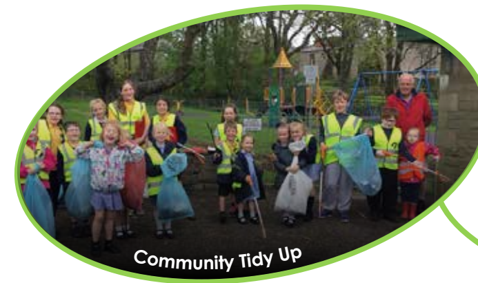
Community Tidy Up

"Being a leader is about having a really good team to help you and being kind to them and working well with them."