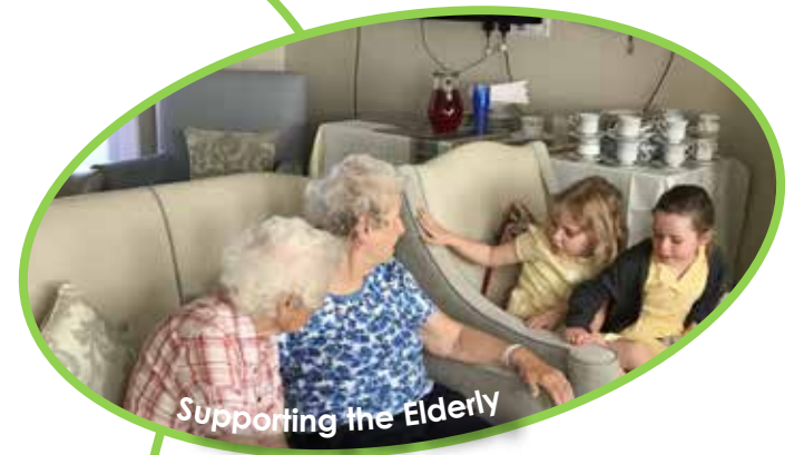
Supporting the Elderly