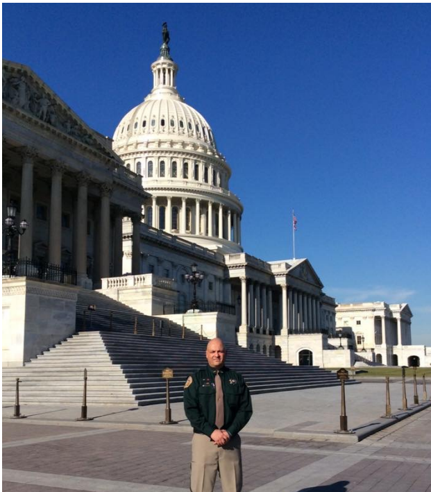
United Sates Congress Washington D.C.

Thousands of Officers and Government Officials in the United States have attended, including Federal, Tribal, Local, and Municipal agencies; members of the United States Congress and their staff. And it is currently certified in Colorado, Illinois, and New Mexico.