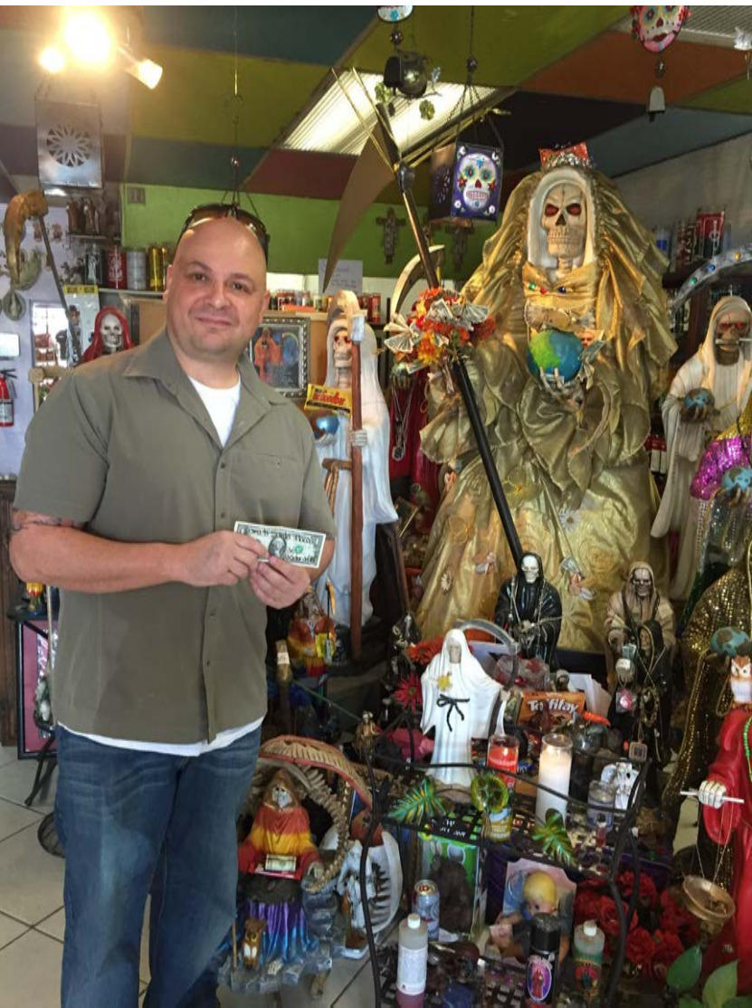
Santa Muerte Chapel Phoenix AZ 2017