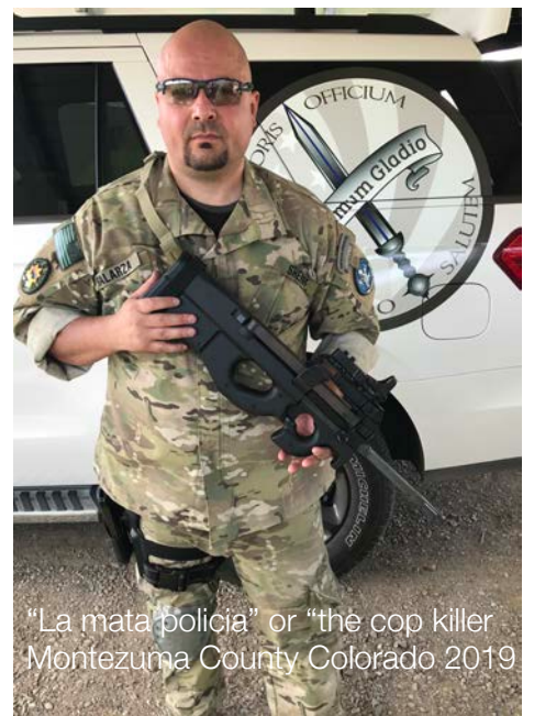
“La mata policia” or “the cop killer” Montezuma County Colorado 2019