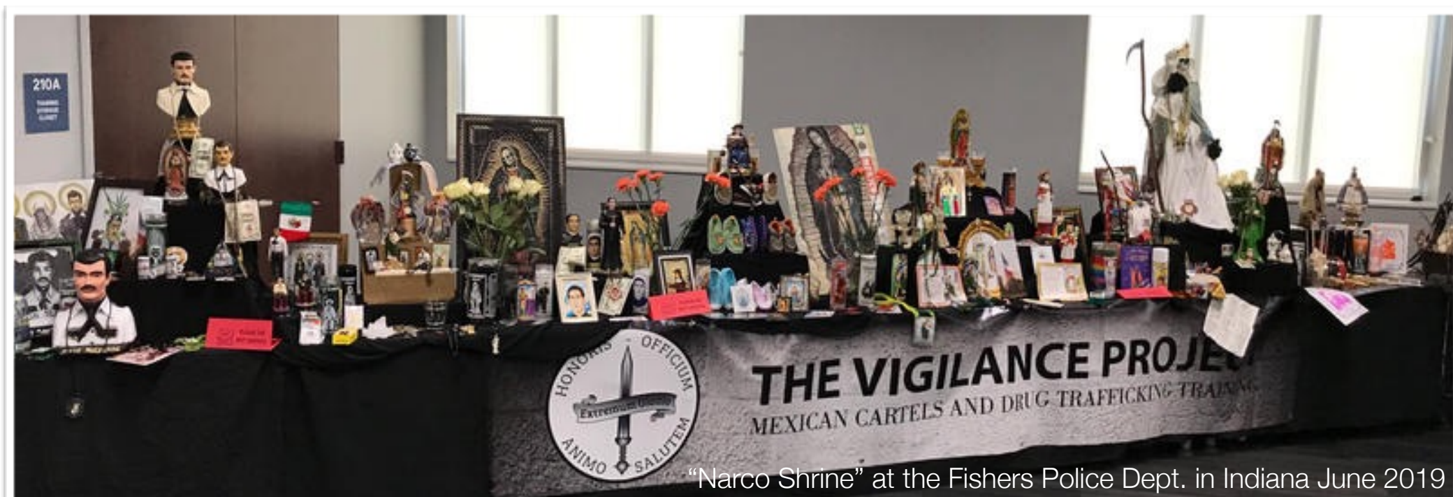
“Narco Shrine” at the Fishers Police Dept. in Indiana June 2019

This course covers the complexities of the Mexican Culture in regards to its history, religion, politics, law, traditions, folklore and much more. The Course provides law enforcement professionals, and other investigators the tools to recognize indicators/factors/items of interest of non-criminal activity versus those of criminal activity. Participants will develop a more thorough understanding of the Mexican culture, and as such be able to provide better service to their ever-changing communities. The beginning of the course has been described as a “cultural awareness class on steroids”, as it relates to both criminal and non-criminal behaviors.