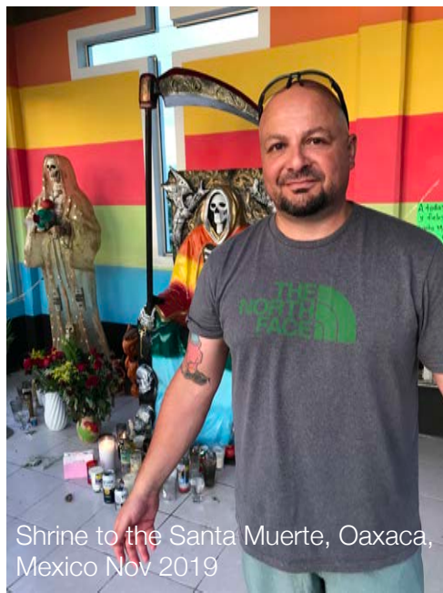
Shrine to the Santa Muerte, Oaxaca, Mexico Nov 2019