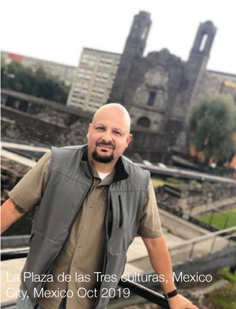
La Plaza de las Tres culturas, Mexico City, Mexico Oct 2019