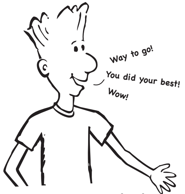
Use Positive Words