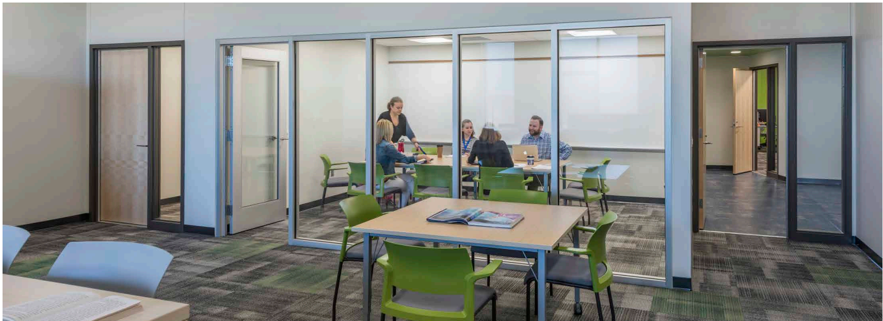
Dickinson Middle School - Dickinson, ND

Within the middle school Administration Office is student registration, communication regarding absences, school-wide practices, official documents and paperwork, meetings with parents, and entry for visitors. The administration offices protect private information and conversations while also providing a warm and safe entry to the rest of the school.