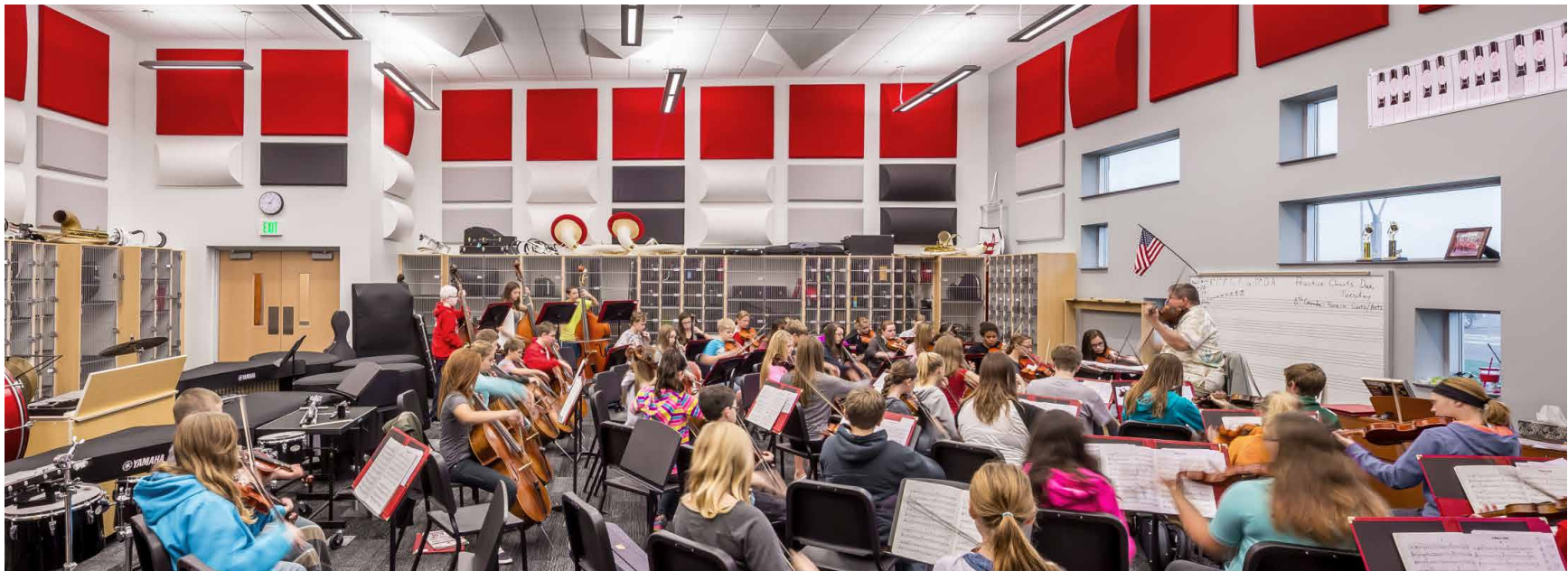
Ramstad Middle School - Minot, ND

Activities in middle school music rooms include rehearsals, music instruction, and meetings. Flexibility in room configuration is necessary in order to accommodate different musical groups and assembly settings. Secure instrument storage and access must be taken into consideration.