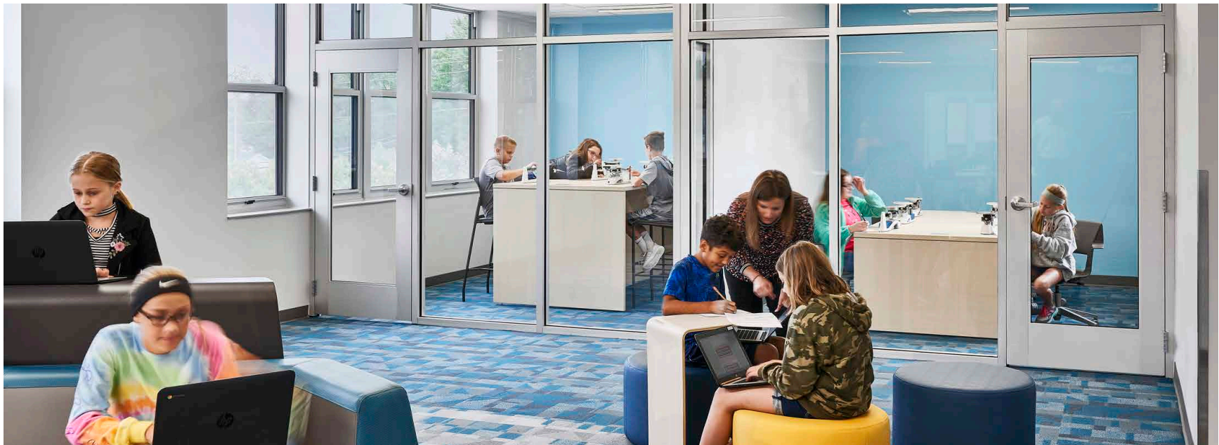
Kearney Middle School - Kearney, MO

Instruction Support spaces (approximately 480 square feet) are those enhancing the instructional goals with remedial help to students, instructors or parents. These spaces are for small group instruction, conferences or meetings. These spaces are not directly loaded with an individual instructor and students but occupied as needed to accommodate different group sizes and learning styles.