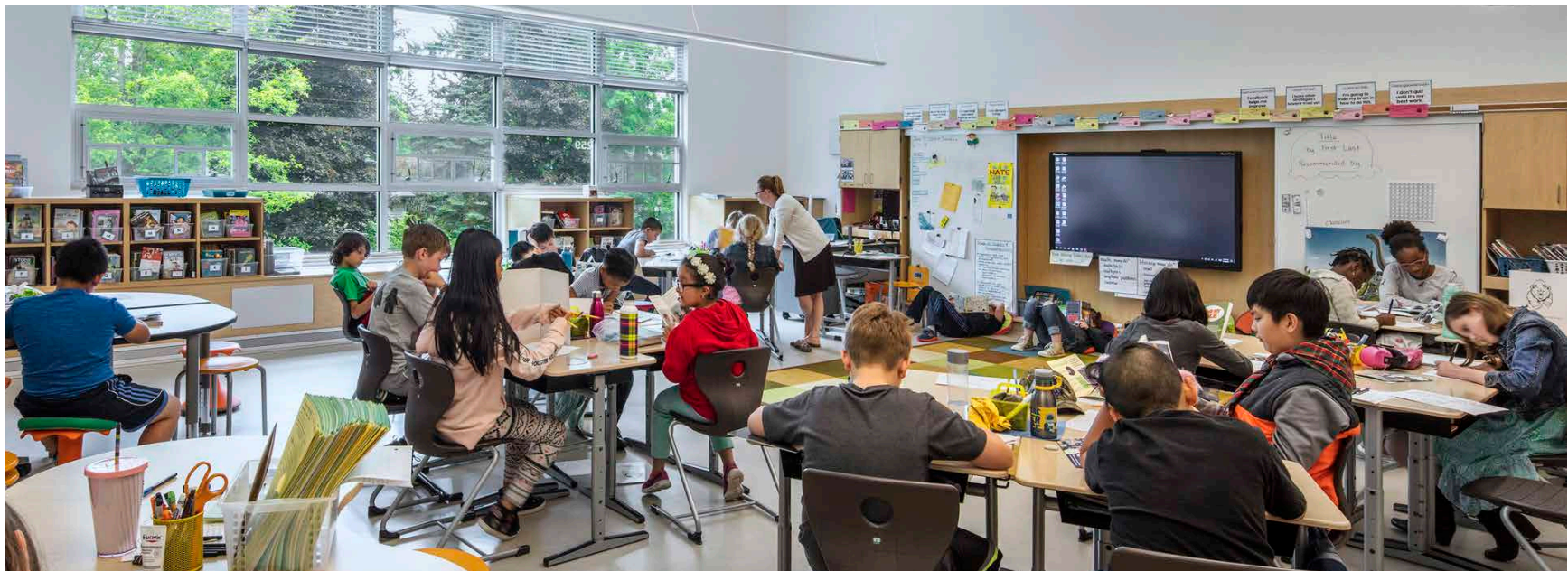
Lake Stickney Elementary School - Lynnwood, WA

Elementary Classrooms are the assigned instructional spaces that serve as the primary home for students throughout the day. These spaces should support small or large group instruction and be flexible enough to accommodate multi-modes of educational instruction. The subjects being taught in these spaces include Common Core State Standards aligned ELA and math, CA CCSS English Language Development Standards, Next Generation Science Standards, Social Studies as well as limited art and music.