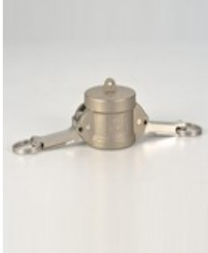
Dust Cap Female