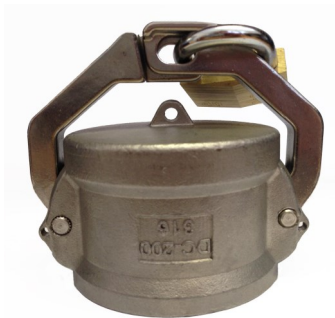
Dust Cap Locking