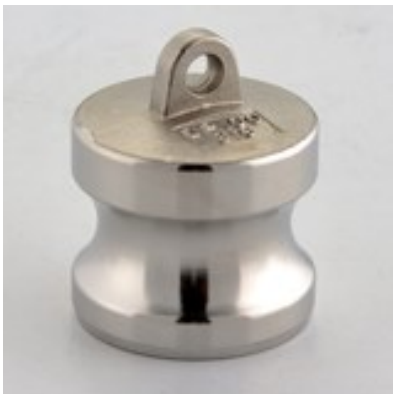
Dust Plug Male