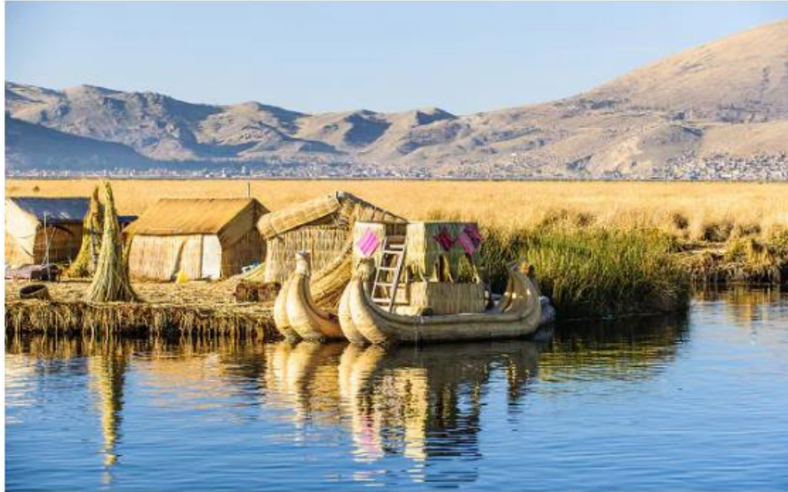
Lake Titicaca

Elsewhere, access to one of the most dramatic inland sites, Kuelap, in the Amazonian region of Chachapoyas, will be improved by a new cable car, which Peru's president, Ollanta Humala, has promised will be in operation by July 2016. The Pachacamac complex, 25 miles (40km) south of Lima, contains 17 pyramids as well as palaces and temples. A major new archaeological museum is scheduled to open in mid-2016, displaying local finds and others borrowed from regional museums.