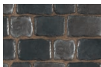
Basalt/Belgian Blue (Blended on site)