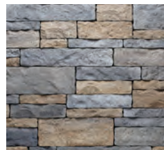
Alpine-Sable Field Blend (50/50)